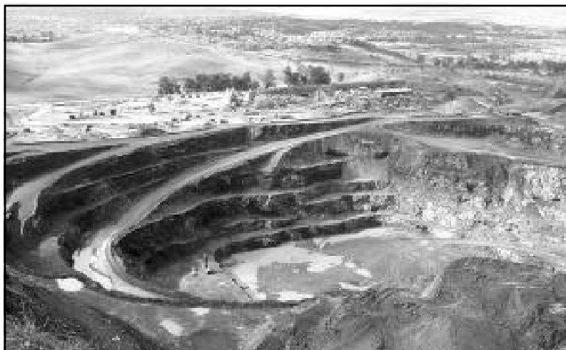
Syar Industries Inc.'s Lake Herman Quarry in Solano County. Jurassic basalt suitable for concrete-grade aggregate is mined here. The rock is a significant source of aggregate for the north San Francisco Bay region.