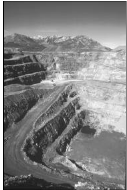
Molycorp Inc.'s world-class rare earths Mountain Pass Mine in San Bernardino County. The ore mined from the quarry is bastnasite, a cesium lanthanum carbonate, which contains 15 different rare earth elements.

Silver production makes up less than 1% of California's total metal production. Silver produced in California is a byproduct of gold production. Iron was produced (it's used in the production of portland cement) and is included in the industrial mineral category.