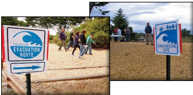
Pictures of evacuation drill in Samoa, California

Tsunamis can cause great loss of life and damage to property, as we learned in the 2004 Indian Ocean Tsunami which killed over 230,000 people in eleven different countries. The key to surviving a tsunami is to know what the warning signs are, and know what to do and where to go if you think a tsunami is about to strike.