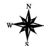
Plate 2 Map 9 of 19