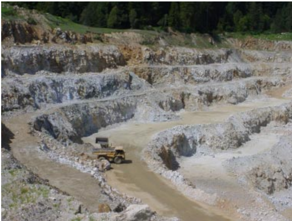
RMC Pacific Material's Bonny Doon Limestone mine (Santa Cruz County). The mine produces high-quality limestone used to manufacture portland cement at RMC's nearby Davenport plant.

Construction sand and gravel was California's leading industrial mineral with a total value of $1.16 billion produced for the year, a 7% increase from 2001 (final USGS data). Sand and gravel production was estimated to be 173 million tons, a 5% increase from 2001. Vulcan Materials Company/Western Division's Boulevard Plant (Los Angeles County) continued to lead the state and the nation in sand and gravel production. Portland cement was the second largest industrial mineral produced in the state with a total of 12.3 million tons valued at about $865 million. Boron, valued at about $486 million, ranked third, and crushed stone ranked fourth with a value of $420 million.