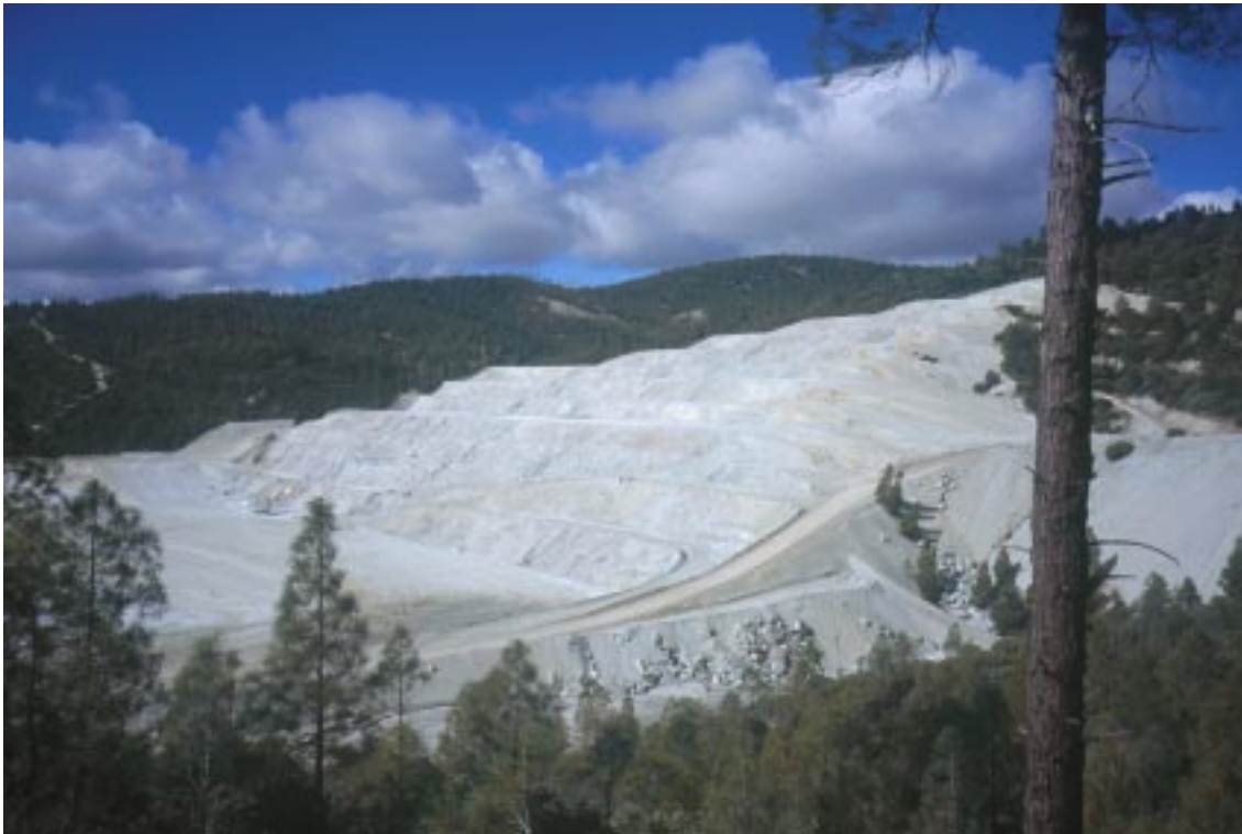
KRAC Inc.'s Joe Asbestos Mine located in San Benito County operated from 1963-2002. The mine produced a short fiber variety of chrysotile asbestos that was primarily exported to Japan.

Mitsubishi Cement Corporation continued its permitting process for a 200-acre expansion of their Cushenbury Limestone Mine (San Bernardino County).