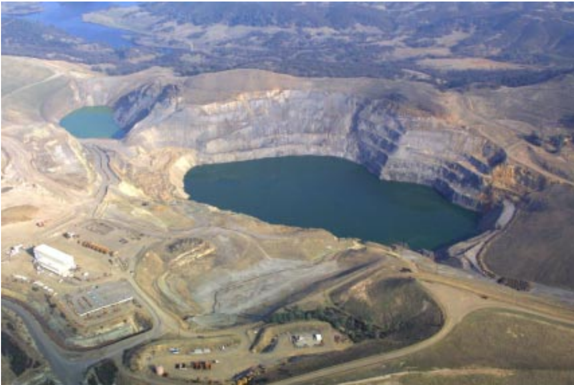
Barrick's McLaughlin Mine located in Napa, Lake and Yolo counties ceased gold production in July 2002. Since the mine's first pour in 1985, about 3,379,000 ounces of gold has been produced making it California's richest modern day gold mine.