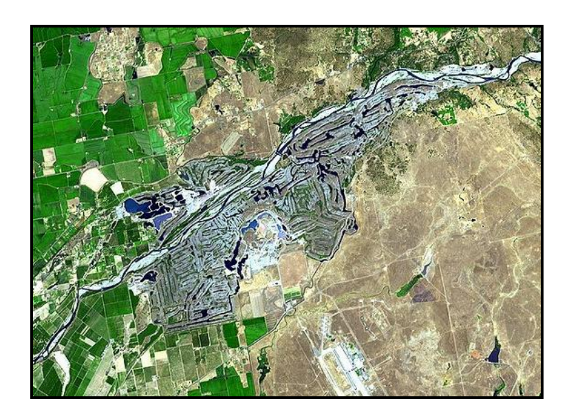
Figure 1 - The Yuba Goldfields

In 1988, the California Geological Survey classified the area Mineral Resource Zone MRZ-2 for construction aggregate and determined that almost 23 square miles of the goldfields, containing more than 2.25 billion tons of PCC-grade aggregate, were available. The area was never designated as a "regionally significant" mineral resource because the SMGB had put the designation process on hold in order to dedicate maximum funds to accelerate mineral land classification. Nonetheless, it is undoubtedly one of the most significant aggregate deposits in the entire state. At the time of the classification study, the entire area of the goldfields had been classified by Yuba County in their general plan as a mineral resource extraction land use area.