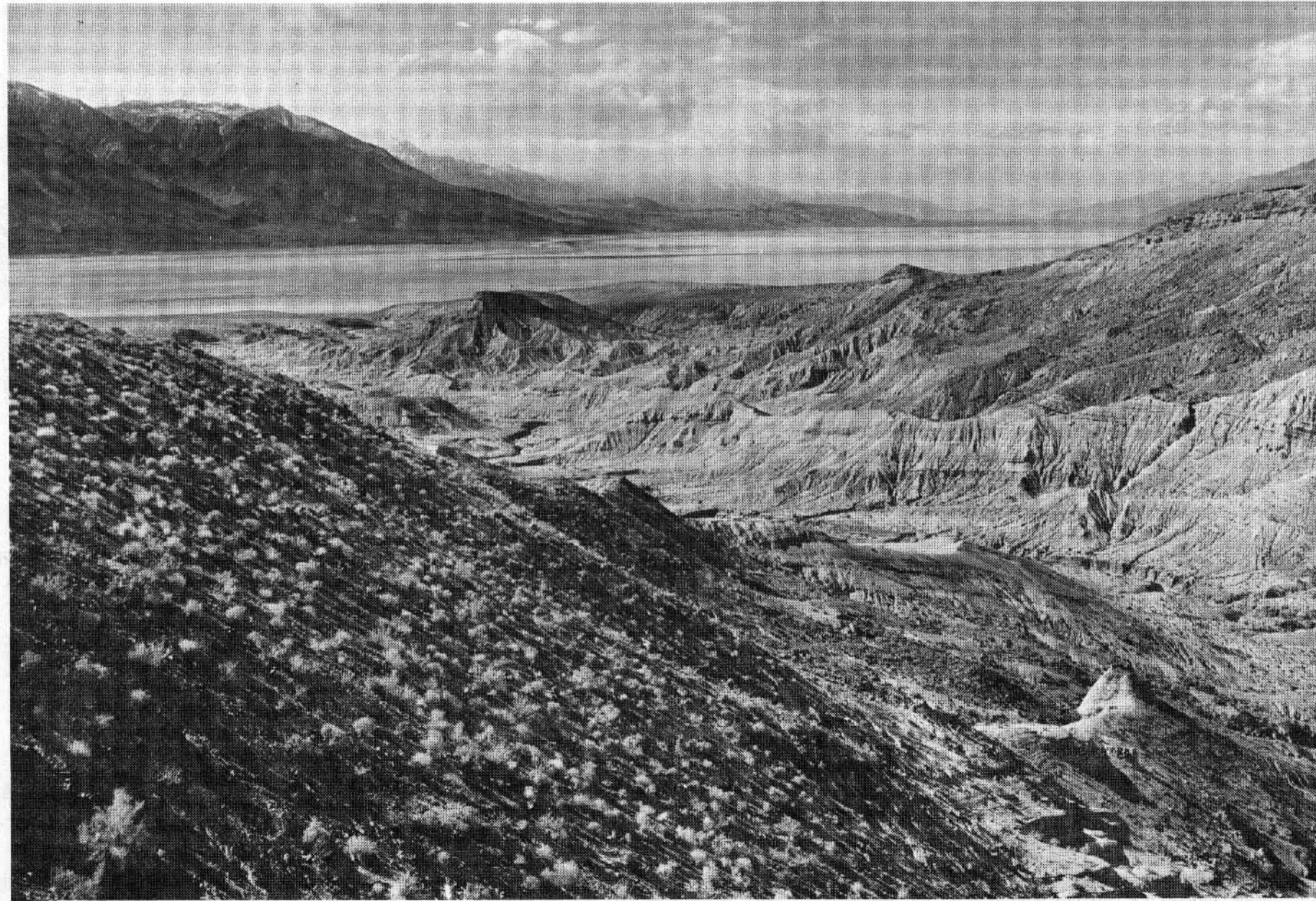
View northwestward across the southern end of Owens Valley, showing the surface of Owens Lake with the Sierra Nevada in the background. West-dipping Plio-Pleistocene Coso Formation, consisting of arkosic sandstone, lakebed sediments, and interbedded rhyolitic pyroclastic rocks was once overlain by older alluvium. The alluvium has been removed by erosion except for two small bluffs near the center of the photograph and the area near the upper right margin of the photograph. Photo by Melvin C. Stinson, 1963.